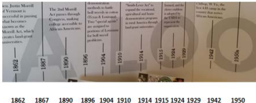
Figure 4. Timeline for the Cooperative Extension System Developed for the 100 th Anniversary Celebration