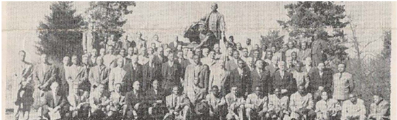
Figure 6. PAWC Participants, 1951

Figures 6, 7, and 8 show participants at 1951, 1989, and 2014 Professional Agricultural Workers Conferences (PAWCs). The predominance of participants in 1951 and 1989 was adults well into their careers. In the last few years, the number of young people participating has steadily increased. In this year's audiences, we have a mixture of young and older participants. This is a good sign that we are preparing the leadership for tomorrow who will continue Carver's goals to use science and agriculture to help his people and in so doing help the world.